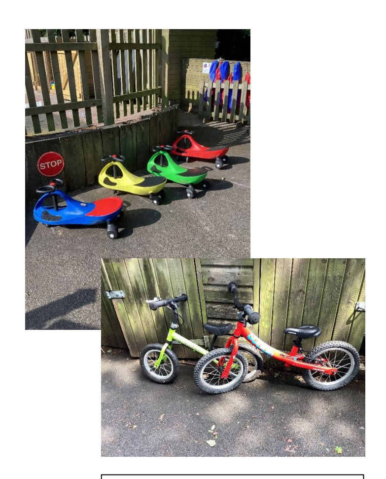
We have lots of different types of bikes.