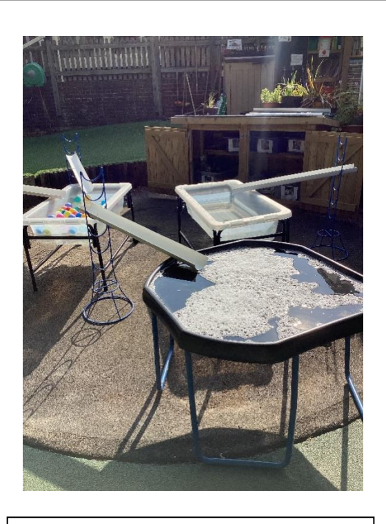
There is a water area.